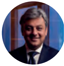
Luca de Meo, Chairman of the Executive Committee of SEAT